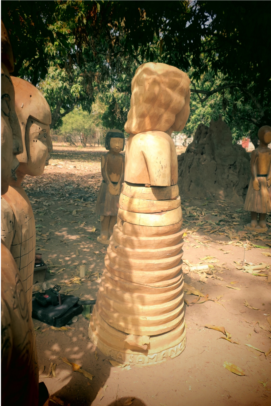
Sculptures l'Allée de ma reine 2016